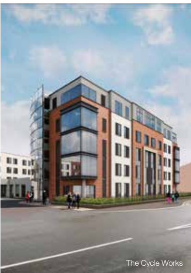
The Cycle Works